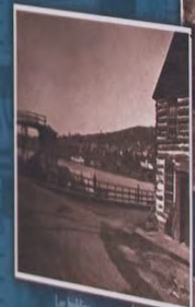
The east end of Shelden Avenue

As early as the 1880s, brick and buildings began to replace Houghton's wooden structures. Within only a few decades became widely known for its new buildings and impressive architecture. Even today, however, one can see a few of the historic frame buildings that transformed the city's earlier era.