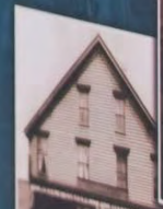
Log buildings at the west end of Shelden Avenue